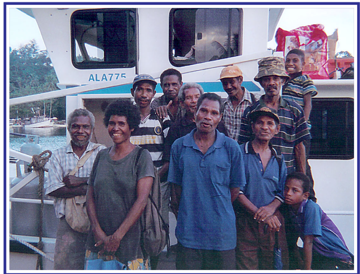
Our Bwaidoka friends as they're departing to return to their villages after the checking.

Lord willing, there is a day coming on which the finished Bwaidoka New Testament will be put in the hands of thankful people—thankful to the Lord for the gift of His Word to them in the language of their heart, and thankful for all of us working together to make it happen. (This is planned for 2018.) We want you to know how special you are to us—and how important. As you hopefully realize by now, this is a team effort, and we immensely appreciate your being on the team with us. Thank you for listening to the Lord and for giving to His work. There is also going to be a day in heaven when you meet the Bwaidoka people whom you've been ministering to. Then you will receive their gratitude face to face.